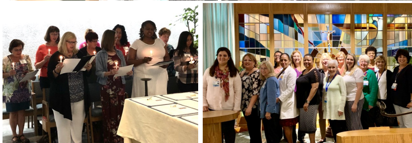
Foundations of FCN 2019 classes pictured above.

"I am so thankful for the opportunity to be a part of this unique and amazing health ministry! I feel very equipped to go out into the community and offer FCN services and resources knowing that I have support, resources, and mentors to continue this ministry."