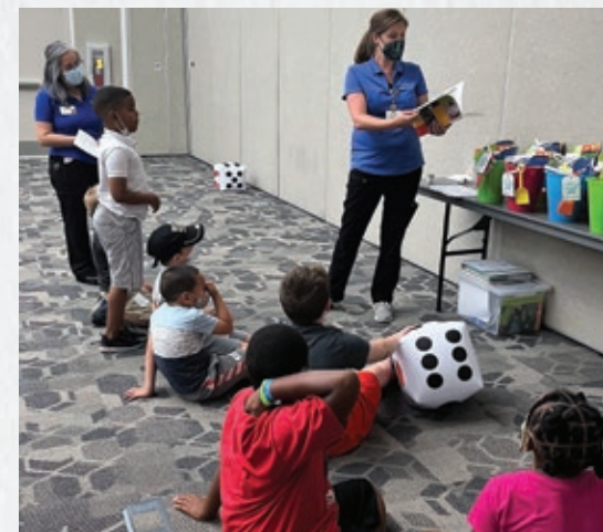
At the Chronic Complex Clinic at St. Joseph's Children's Hospital, siblings of patients are invited to "SibShop Retreats" as part of BayCare's support for families with medically fragile children. BayCare's approach was the model for the federal ACE Kids Act.

Intentional and strategic outreach was integral in getting a robust and representative response rate. Due to the ongoing COVID-19 pandemic, surveys were primarily deployed electronically, using either a direct link or QR code for easy access. The collaborative was prepared for this and leveraged our partners across the county to ensure that the voices of our residents were heard. Even during the challenges posed by the pandemic, the survey was disseminated in libraries, churches, food pantries and community centers. This strategy allowed for engagement of low-income, minority and medically underserved populations. Through the collaborative's efforts, every zip code in Hillsborough County was represented in the survey collection.