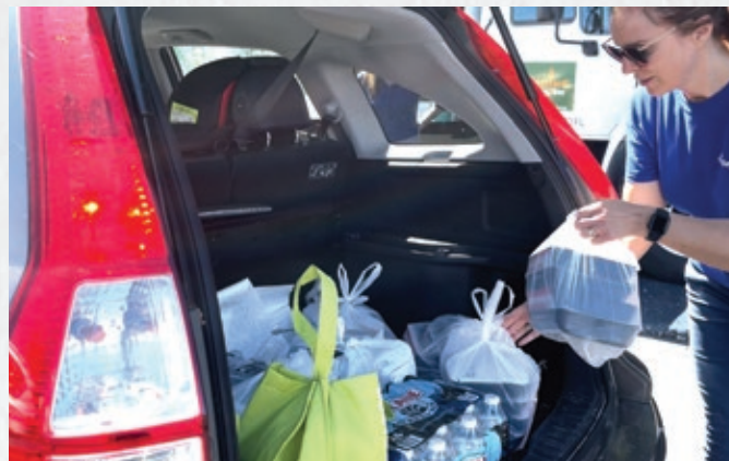
A BayCare team member helps with food distribution during a Feeding Tampa Bay event.

The 2023–2025 implementation plans for St. Joseph's Hospitals and South Florida Baptist Hospital were thoughtfully developed to leverage hospital and community resources, while also working collaboratively across multiple sectors to engage new community partners. To align with population and public health best practices and acknowledge that improving health is more than just accessing health care, the plans include a strong and directed focus on the social determinants that impact health.