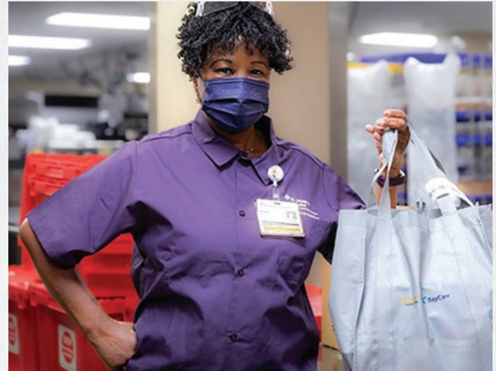
A Food and Nutrition team member at St. Joseph's Hospital-North prepares Healing Bags as part of BayCare's efforts to help patients who are food insecure. Upon discharge, patients receive a bag with two to three days of food, along with information about additional resources in their community.

By December 31, 2025, improve overall health through interventions that are inclusive of health and nutrition education, screenings, exercise initiatives and place-based food access.