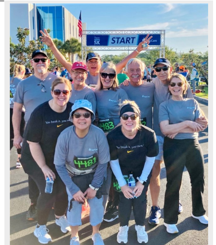
The SAH team, including several spouses and a friend, came out April 6 for the Annual BayCare 5K at the main office in Clearwater, to support Feeding Tampa Bay.